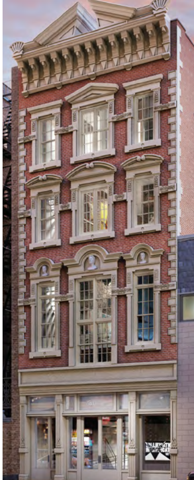
Rendering: 74 East 4th St.

La MaMa's historic, landmark building at 74 East 4th Street is undergoing an urgently needed complete renovation and restoration to preserve the historic façade, create building-wide ADA accessibility, and provide much needed performance, exhibition and community space for decades to come.